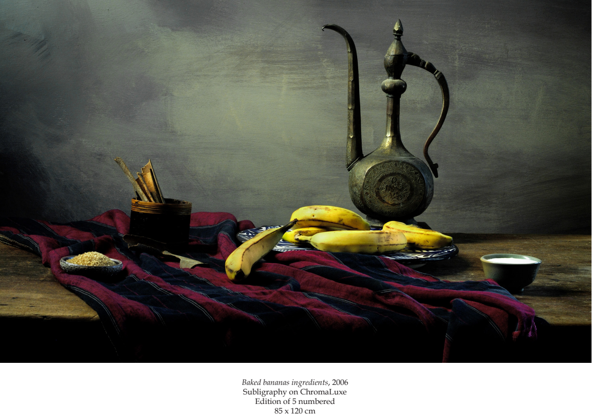
•• •• ••

The abundant garden of her childhood, a real jewel of the Mas de Fourques where peacocks are kings and wander at their convenience, is her source of inspiration, multitude of plants, bamboo seeds, lotus seeds and dried leaves ... mysterious alchemy of nature.