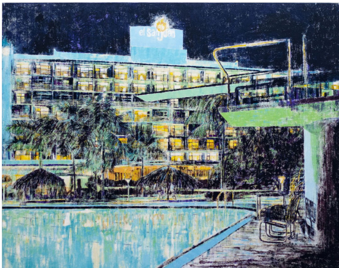
Enoc Perez , Hotel San Juan, Isla Verde, Puerto Rico , 2004, Oil on canvas, 182,9 x 228,6 cm

Exhibition from March 13 to May 18, 2013