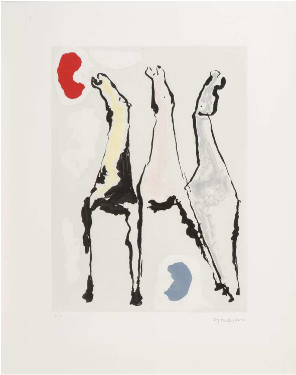
Marino Marini , "Tre Cavalli", 1977, 59.3x74.2cm, colored etching and aquatint, enhanced by hand, numbered and signed.