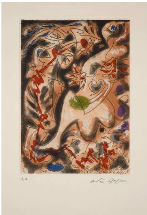
André Masson "Lansquenet et courtisane", 1964, signed and numbered engraving.