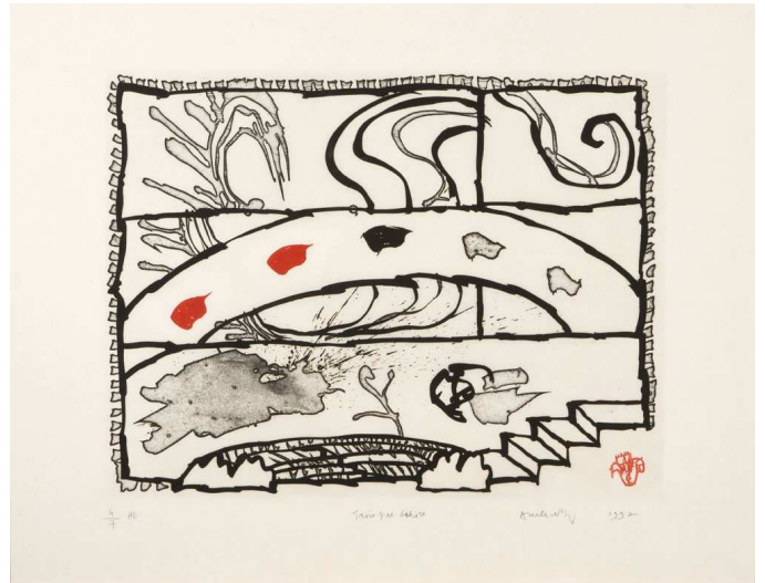
Pierre Alechinsky , "Trois pas dehors", 1992, 91.5x71.5cm, signed and numbered engraving.