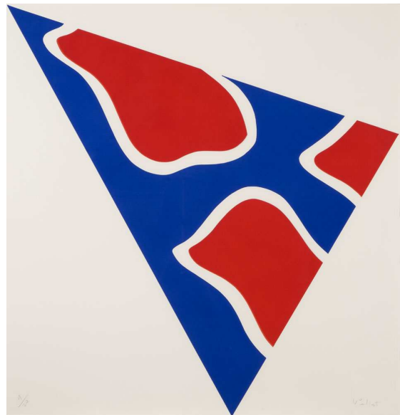
Claude Viallat , "Triangle", 1992, 83x87cm, Colored aquatint, signed and numbered.