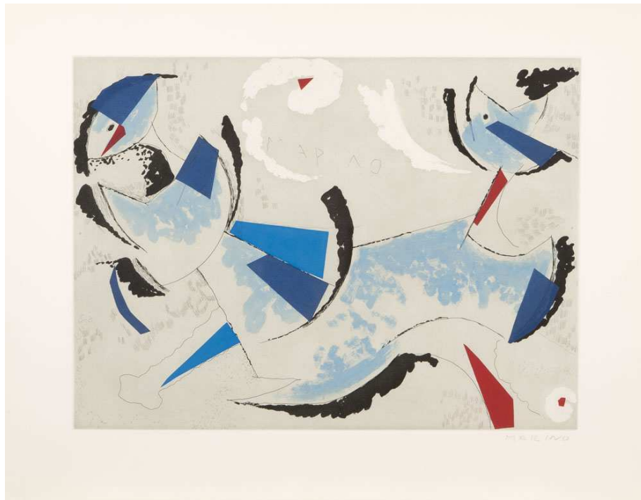
Marino Marini , signed and numbered engraving, 52.2x 67.4 cm.

Art Paris Grand Palais March 29th to April 1st, 2012