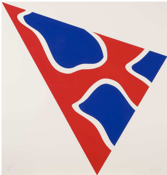
Claude Viallat , "Triangle", 1992, 83x87cm, Colored aquatint, signed and numbered.